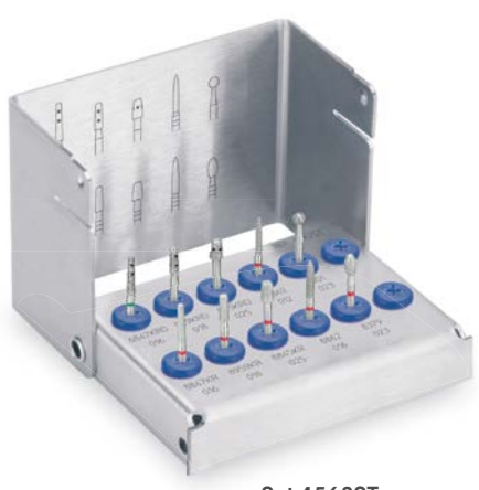
Set 4562ST In a bur metal block suitable for sterilization