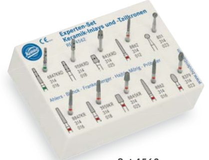
Set 4562 In a plastic instrument trav